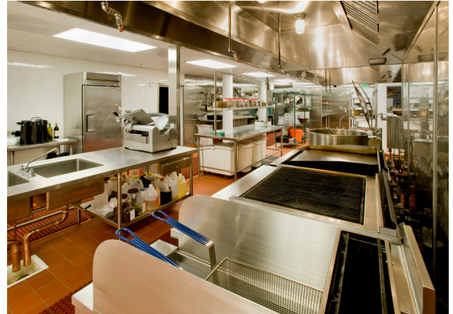
This photo illustrates the correct installation of a metal baffle plate between the open flames from the range and the deep fat fryer. Metal baffles should be used only when there is not sufficient space available to provide a 16" clearance between the deep fat fryer and any source of open flames. Baffle filters are seen above the range and fryer.